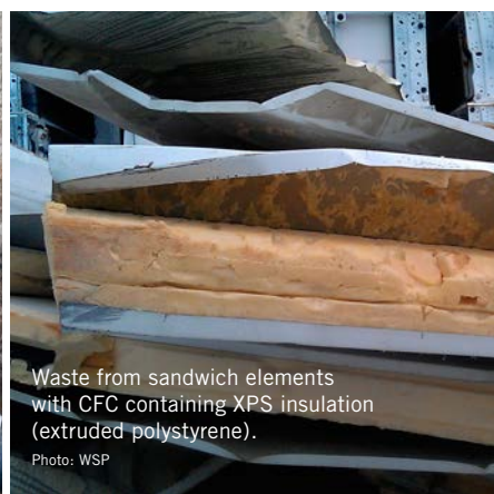
Waste from sandwich elements with CFC containing XPS insulation (extruded polystyrene).