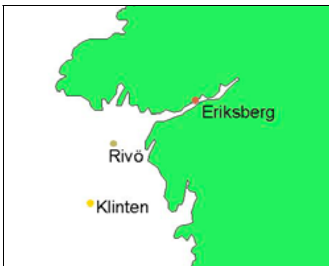
Figure 2. The sampling site Eriksberg is located at the outlet of Göta Älv, and the sampling sites Rivö and Klinten at the inner part of the estuary.

The sediment samples were collected at three sites in the Göta Älv estuary close to Göteborg at the Swedish west coast in September 2007, see Figure 2. Two samples were collected at the sites Eriksberg and Rivö, respectively, and one sample at the reference site Klinten.